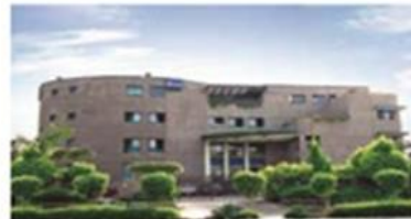
JAGAN INSTITUTE OF MANAGEMENT STUDIES, 3, Institutional Area, Sector-5, Rohini, New Delhi