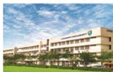
JAGANNATH UNIVERSITY, NCR - State Highway-22, Bahadurgarh - Jhajjar Road, (Haryana)