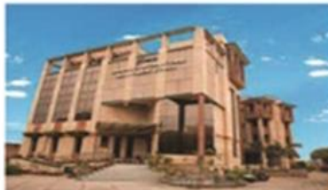
JAGANNATH INTERNATIONAL MANAGEMENT SCHOOL, MOR, Pocket 105, Kalkaji, New Delhi