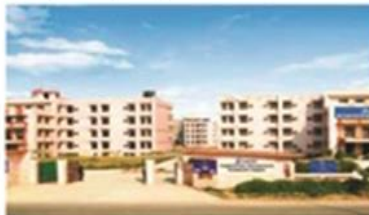
JIMS ENGINEERING MANAGEMENT TECHNICAL CAMPUS Knowledge Park-III, Greater Noida, U.P.