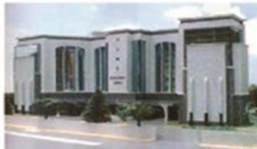
JAGANNATH INTERNATIONAL MANAGEMENT SCHOOL, OCF, Pocket-9, Sector-B, Vasant Kunj, New Delhi