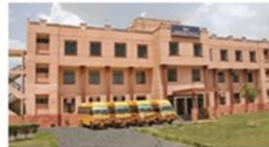
JAGAN INSTITUTE OF MANAGEMENT STUDIES, Jaipur.