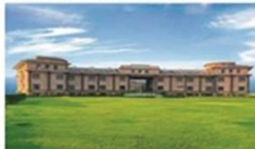
JAGANNATH GUPTA INSTITUTE OF ENGG. & TECHNOLOGY, Plot No. IP2 & 3, Base-IV, Sitapura, Indl. Area, Jaipur (Raj)