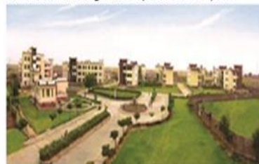
JAGANNATH UNIVERSITY, Village Rampura, Tehsil Chalsu, Jaipur (Rajasthan)