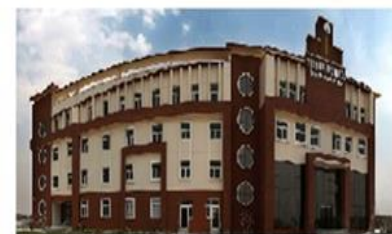
Jagannath Institute of Management Sciences, VK-II, Plot No. 3, Phase-II, Inst. Area, Vasant Kunj, New Delhi-110070