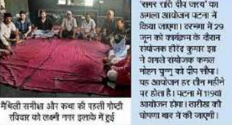
सगर राति दीप जल्य का अगला आयोजन पटना में किया जाएगा। इसका आयोजन 29 जून को कार्यक्रम के दौरान सूर्यनाथ होटल गुजरात में करने की योजना है।