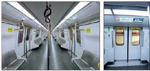
OLD, STILL GOLD: Last year, 12 trains were refurbished, while work is currently under way for 18 trains on Red Line with the installation of CCTV cameras, mobile charging points and LCD-based dynamic metro routes.

The refurbishment was on a gradual manner and was targeted for completion by March 2025, a Delhi Metro Rail Corporation official said. Following this, 22 trains on Blue Line are planned for refurbishment. A contract is likely to be awarded by the end of this month for these 22 trains, and the target for completing this task is two-and-a-half years.