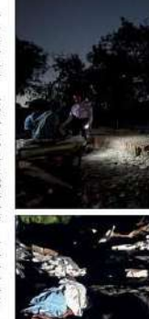
IN THE MIDDLE OF HOWHERE: The demolition has left many poor individuals, mostly daily wage labourers, displaced on the streets.

New Delhi: Delhi Development Authority (DDA) is rebuilding a men's shelter that was "incompletely" demolished, with the reconstruction work expected to take approximately a week.