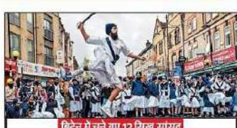
ब्रिटेन में जून 9-12 सिख सांस्कृतिक कार्यक्रम

पंजाबी बोलियों को बचाने के लिए 'सुनखी पंजाबने' की शुरुआत हुई है। यह कार्यक्रम पंजाबी बोलियों को बचाने के लिए है।