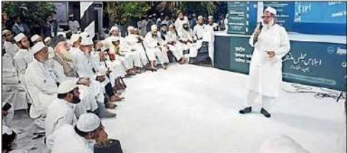
सालाना सभा: दो दिन की इस महत्वाकांक्षी बैठक में जमीयत उलमा-ए-हिंद के सलाहकार 2 हजार सदस्यों ने भाग लिया

जमीयत उलमा-ए-हिंद की प्रबंधन समिति की सभा में अपील