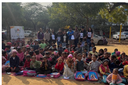
Volunteers educating kids about India's inspiring leaders

CII Yi YUVA organized Project Tricolour Tales on 24th January 2026 as celebration of Republic Day to educate children about national values and inspiring Indian personalities. Through engaging storytelling and visual aids, children learned about leaders such as Dr. A.P.J. Abdul Kalam, Mahatma Gandhi, and Dr. B.R. Ambedkar.