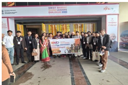
Participants during "National Youth Day, 2026"

Prayaas- the NSS Club actively participated in "Viksit Bharat Young Leaders Dialogue 2026", held in Bharat Mandapam from 9th-12th January, 2026 to celebrate National Youth Day organized by Ministry of Youth Affairs and Sports in collaboration with Regional Directorate of NSS. During the event, the students volunteered in coordinating with the arrival of delegates, accommodation, and event management along with attending "Colours of Viksit Bharat" orientation program and interaction with astronauts. The students also participated in various cultural activities like dance performance and painting competition. The event enabled the students to gain a deeper understanding of Viksit Bharat vision through leadership exposure.