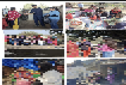
Students during “Swasthya Sakhi Abhiyan,”