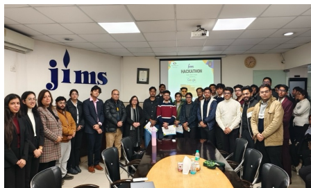
Participants with Director and faculties