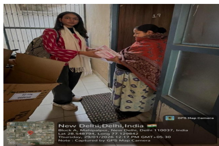
The volunteer distributing sanitary pads