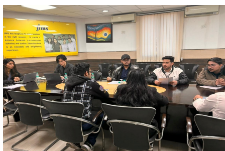
Students engaged in a group discussion

The Placement Cell hosted an on-campus placement drive with Uniqlo on 15th January 2026. The drive included aptitude tests and group discussions, allowing students to showcase analytical, communication, and teamwork skills. The institute thanked Uniqlo's HR Business Partner and Talent Acquisition Lead for their guidance and engagement.