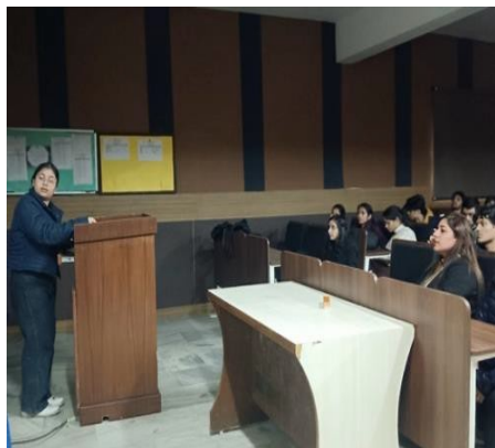
Student presenting solutions for ecological challenges