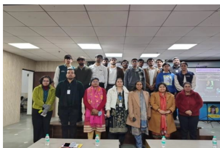
Ms. Kiran with faculty members and students

discussions, enabling students to build confidence in protecting their ideas.