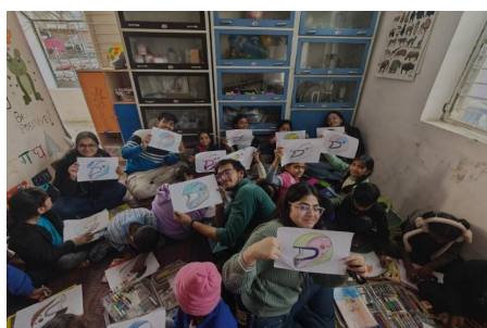
Volunteers educating children about road safety

On 20th January 2026, CII Yi YUVA, under its Road Safety vertical, conducted Project Suraksha Setu to create a safe and engaging learning environment for children. The session included creative activities, interactive discussions, and simple games aimed at building confidence, fostering emotional awareness, and encouraging positive behaviour. The initiative cultivated a supportive space where children felt comfortable expressing themselves and connecting with volunteers, making the experience both meaningful and enjoyable.