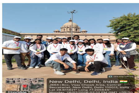
The NSS volunteers at Udyog Bhawan, New Delhi.

From 19th to 26th January 2026, the NSS Cell participated in the Republic Day celebrations at Udyog Bhawan, organized by the Ministry of Defence. The volunteers underwent briefings, site visits, and a full-day rehearsal to prepare for roles in public guidance, crowd management, and event coordination. On 26th January, they helped ensure a smooth and orderly Republic Day Parade, gaining hands-on experience in discipline, teamwork, and public service.