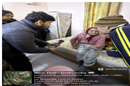
The volunteer presenting a rose to the elderly

The NSS Cell organized a visit to Aashirwad Old Age Home on 2nd January 2026. During the visit, volunteers interacted personally with the residents and distributed gift packages containing warm mufflers, roses, and refreshments to make them feel appreciated and cared for. They also engaged in heartfelt conversations, listening to the residents' life stories and extending New Year wishes, thereby helping to reduce feelings of loneliness and isolation among the elderly.