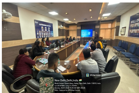
Faculty members during FDP

participants' research competencies, digital confidence, and preparedness to navigate the AI-driven future of academia.